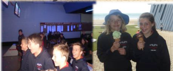
Grade 6s enjoying their Big Day Out last Friday

SRC students visited Mt St Vincent Nursing Home on Tuesday to sing carols and spend some time sharing stories with the residents. The children were excited to receive a chocolate and a cup of lemonade.